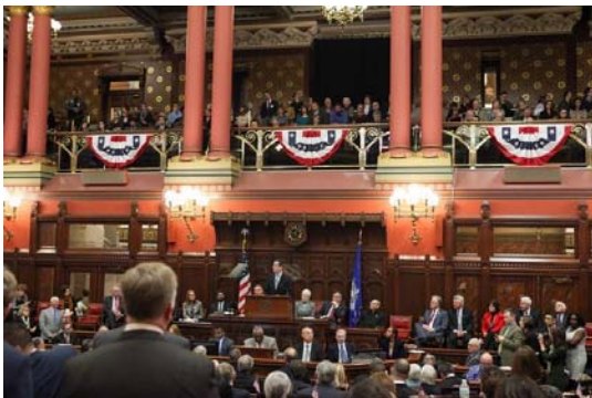
Connecticut Governor Dannel P. Malloy delivered his 2017 State of the State Address at the State Capital in Hartford on Jan. 4. He helped put through tax income increases in 2011 and 2015, raising the top rate to 6.99%.

It's a strange turn for Connecticut, which has the highest per capita income in the country, according to the Bureau of Economic Analysis, and is home to hundreds of hedge funds, Yale University, and businesses like insurer Aetna Inc. and industrial giant United Technologies Inc.